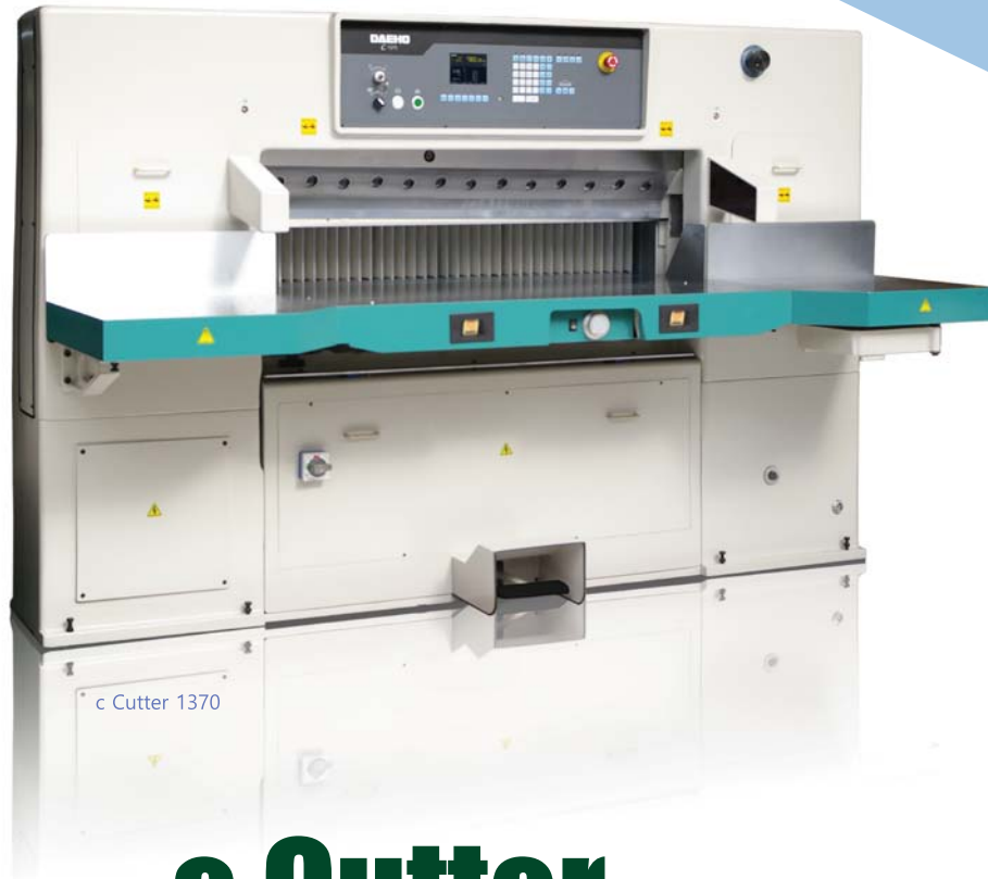
c Cutter 1370