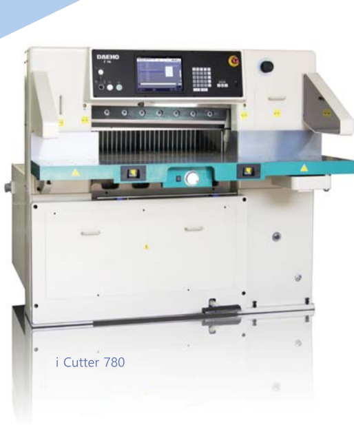
i Cutter 780