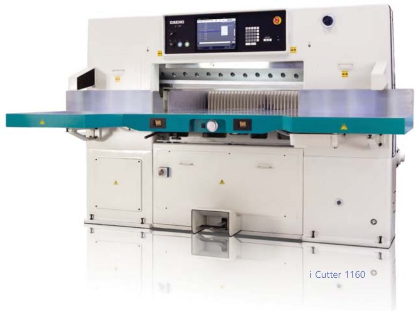
i Cutter 1160